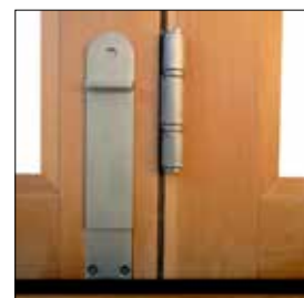
SURFACE MOUNTED LOCK