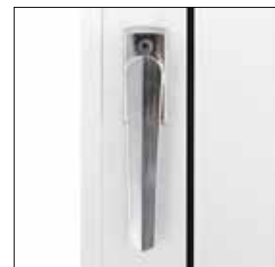
FOLDING DOOR LEVER