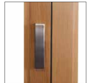
FOLDING DOOR LEVER