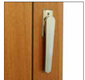
FOLDING DOOR LEVER