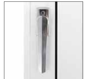
FOLDING DOOR LEVER