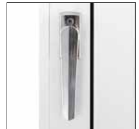
FOLDING DOOR LEVER